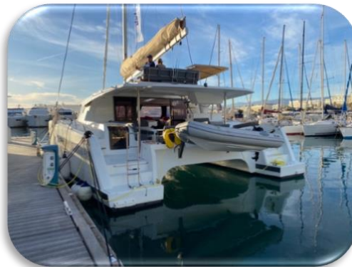
Safely moored in Port Canto, Cannes