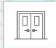
Fire Door Installation and Remediation