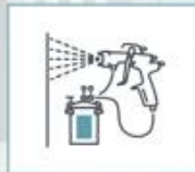
Intumescent Paint & Structural Steel Protection