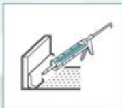
Firestopping and Penetration Sealing