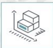
Acoustic Seals and Cavity Fire Barriers