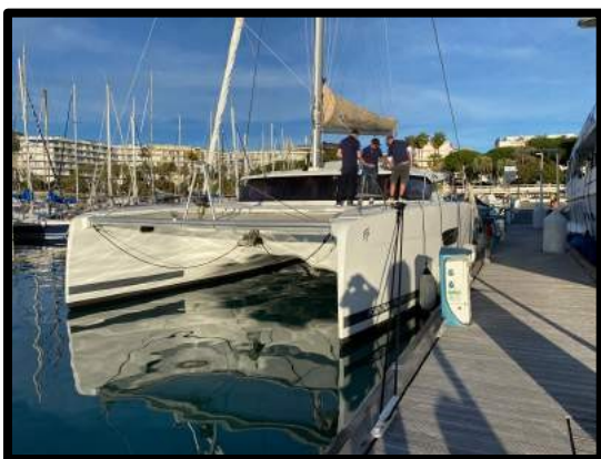
Safely moored in Port Canto, Cannes

The dawn of Saturday confirmed our confinement to port. On Sunday morning it was still choppy but mid-morning the opportunity came to make a run for Cannes. Sadly, we lost the opportunity for our planned one-night stop in Saint Tropez. It was late morning when we departed Port Pin Roland and just before 18:00 we arrived in Port Canto, for a splendid evening a great week in Cannes on board the catamaran.