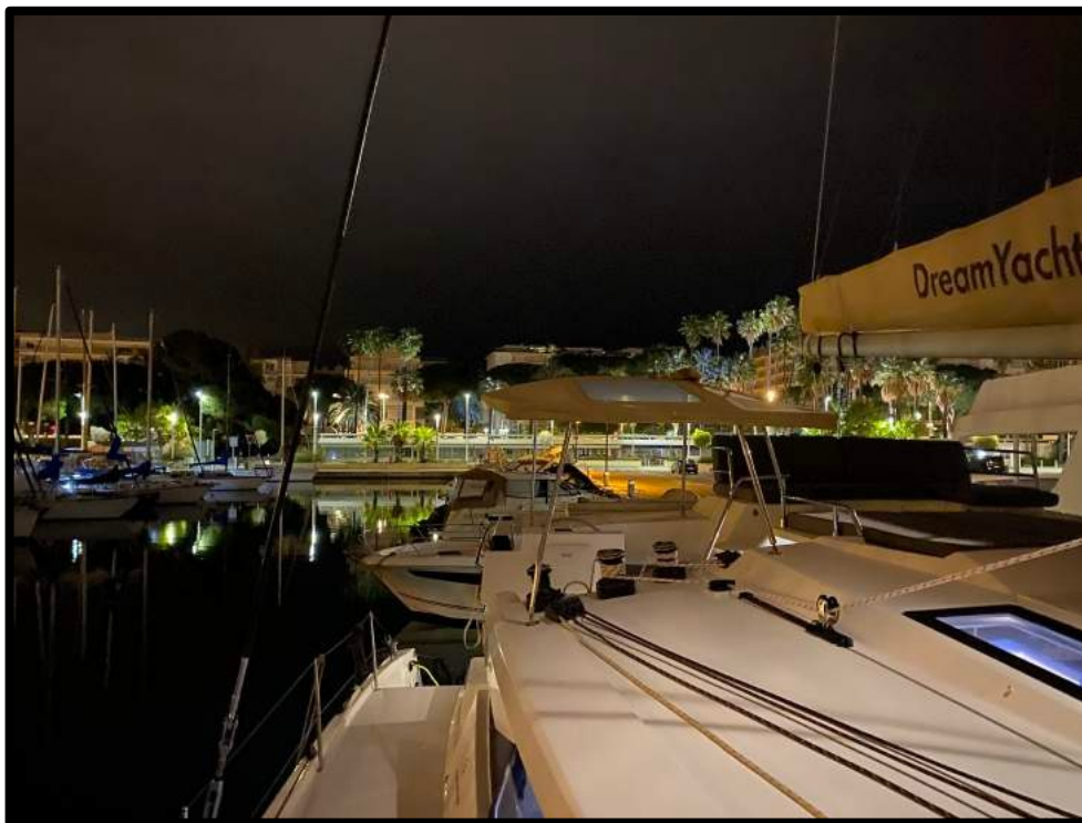
Night Views from the Catamaran