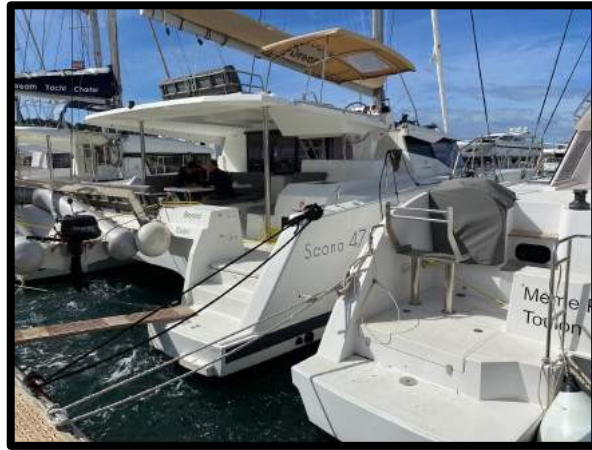
The “Walking the Plank”

Weather reports further confirmed that the Mistral was likely to impede our Saturday travel plans. On Friday evening we retired to the port restaurant full of optimism despite the weather reports about our Saturday passage. After a good night out getting back onboard the yacht in choppy conditions in the port “Walking the plank” to get back onboard was interesting.