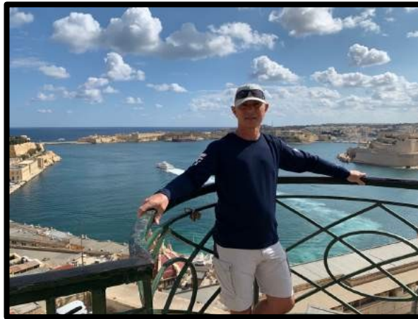
Offshore racing in the Caribbean, can it get any better?