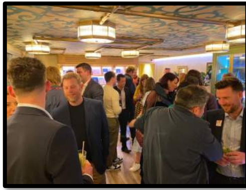
Harry's Bar Port Canto, Cannes